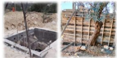
Above: new wells under construction

We are replacing storage tanks and solar panels for the poorest Christian families with old, rusty or unhygienic tanks.